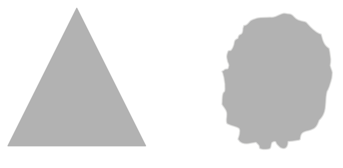
Figure 9.1—The Mechanistic and Organic Organizational Structure